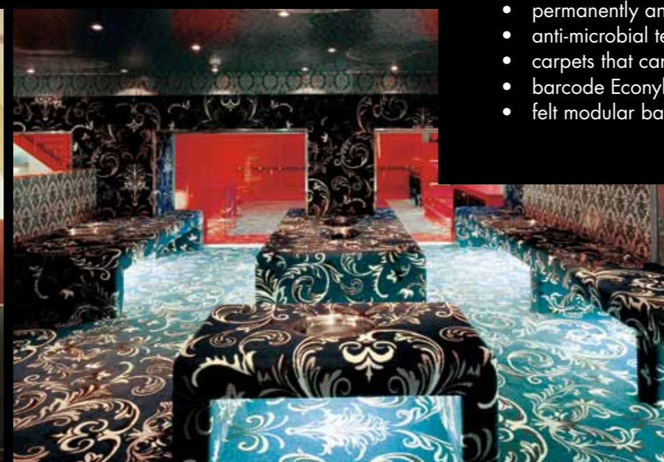
Helsinki Club, Finland