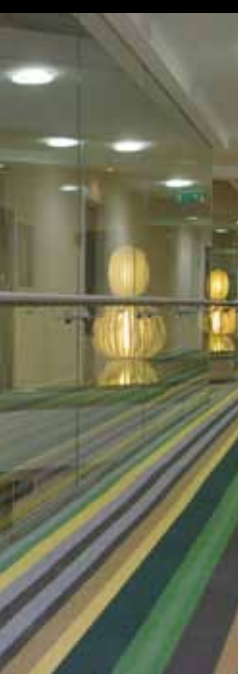
Patrick Street Apartments, Ireland