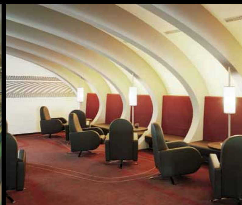
Lindner Nürburgring, Germany