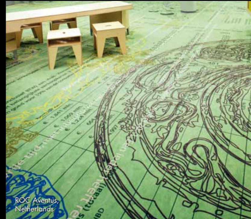
ROC Aventus, Netherlands