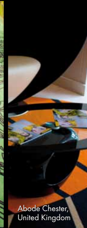
Abode Chester, United Kingdom