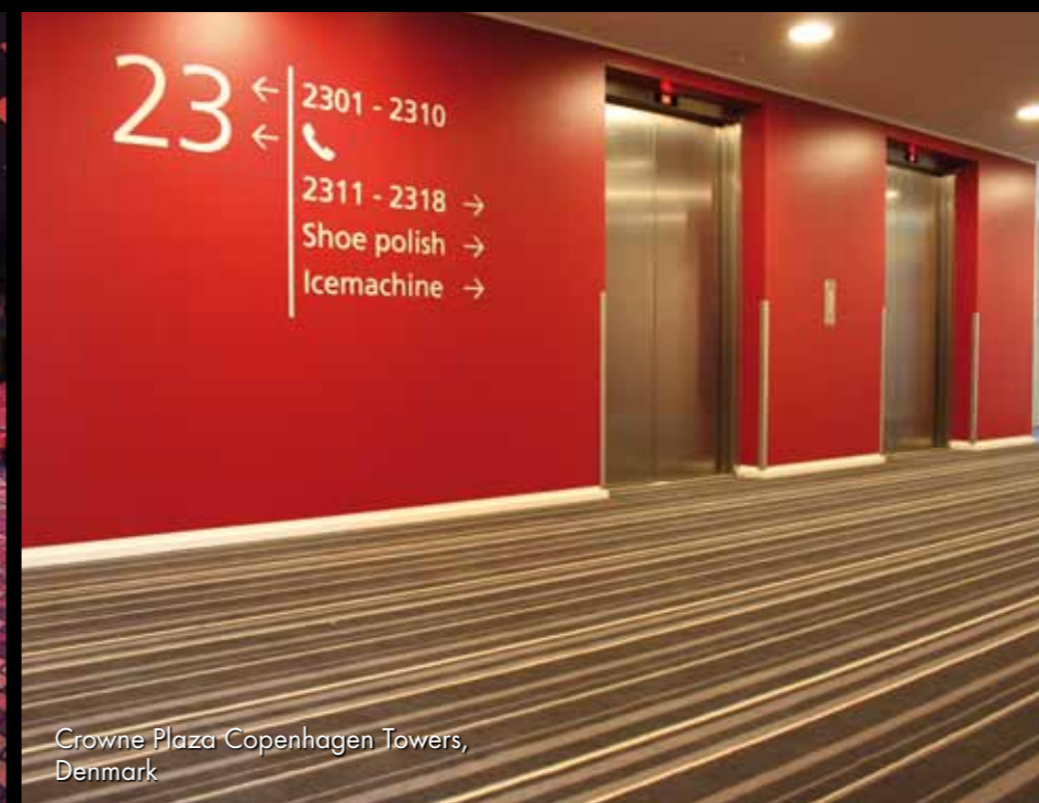
Crowne Plaza Copenhagen Towers, Denmark