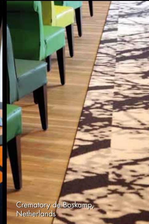
Crematory de Boskamp, Netherlands