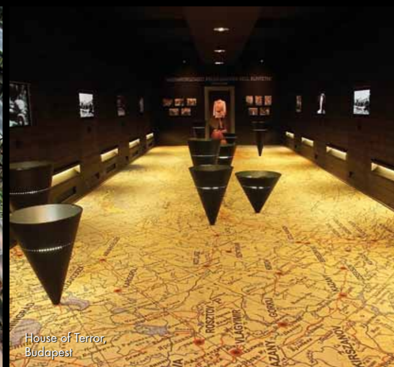
House of Terror, Budapest