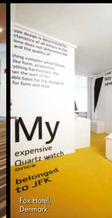
Fox Hotel, Denmark